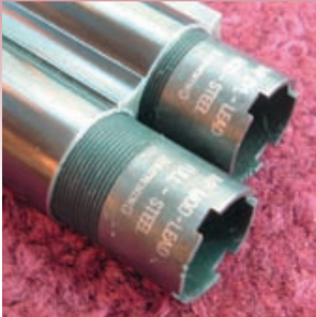
(Above) The Invector choke tubes offered on the Mk 70 fit flush to give a nice, subtle appearance. They also print very good patterns with careful cartridge selection. Bluing on the barrels is top notch too.

measured too) can reveal some discrepancies in the amount of choke and what was actually stated on the choke tube. Early Invector choke tubes were particularly errant - as much as 7-10 thou difference was evident. However current Invector chokes measure up quite well. The choke spanner is another plus here, the T spanner a quantum leap better than those nasty pressed steel models that were offered years ago. If you wish to use the standard Browning chokes, I would recommend getting them measured to determine their actual constriction. If you don't wish to use these chokes, there are plenty of after market makes available.