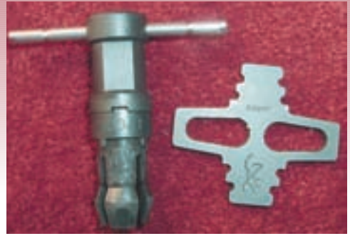
(Right) Current Browning / Miroku guns are supplied with the T wrench, while the Briley tubed Mk 10 Miroku's have the Briley Speed wrench.

The ejectors on this gun are typical Browning / Miroku, consisting of the two-piece, non spring-loaded units, which are very easy to remove to clean or replace in case of breakage. Ejection is produced by kickers that are attached to the fore end iron, and work to eject the fired cartridge once the gun is open.